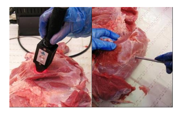
Figure 1. BTS probe (left) and BTP probe (right).

validation procedure the calibration sets were randomly divided in a 66 hams population for model determination while 33 hams served for cross validation. Cross validation were run one hundred times with PLS component numbers varying from 1 to 20 (figure 3). The PLS component number that was used for the prediction model determination corresponded to the first minimum of mean of false classification rate in cross validation.