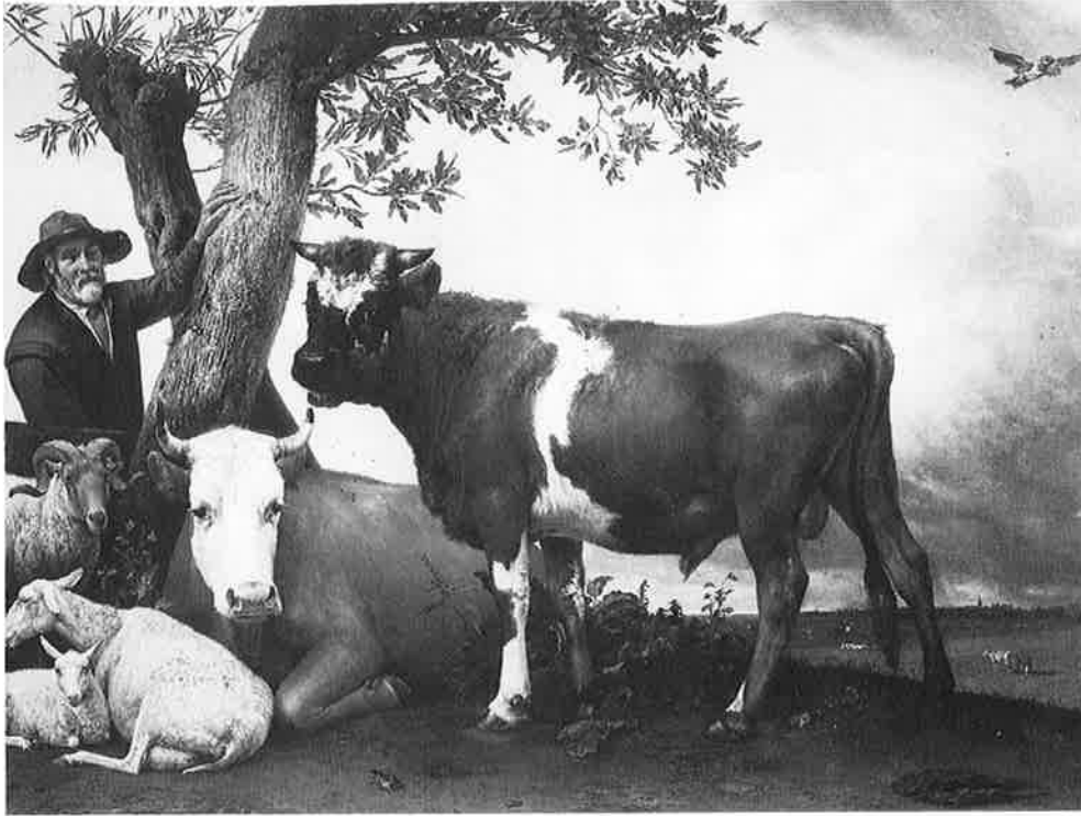
Meat Animals in historical perspective. "The young bull" painting by Paulus Potter, 235,5 x 330 cm, 1647. Collection Mauritshuis, the Hague.