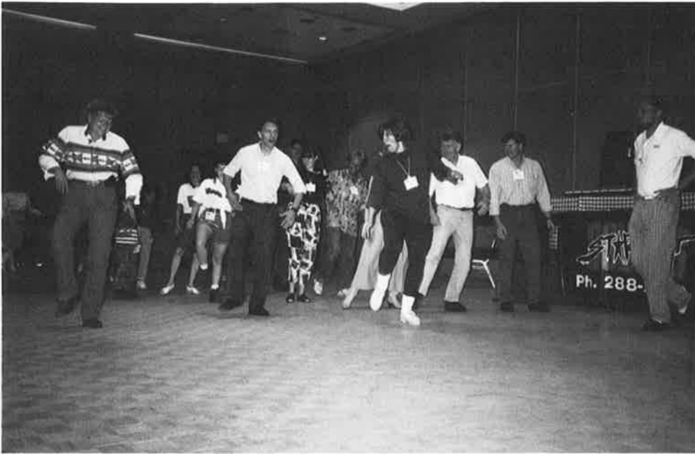
Line dancing (instruction provided).