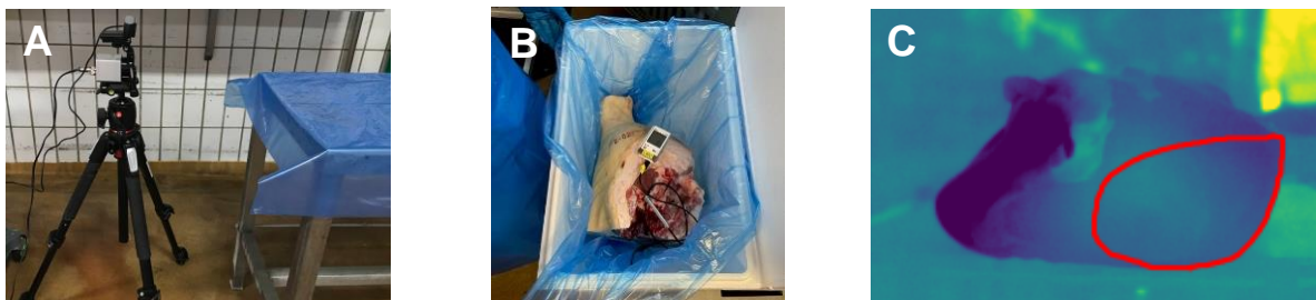
Figure 1. Camera setup used to obtain thermographic images (A), placement in flamingo boxes for adiabatic equalisation (B) and manually annotated pixel region used to calculate T_{surf} (C).

A study based on seven groups of pig carcasses (83.2-88.9 kg hot carcass weight, lean meat percentage 57.9-66.1%) given different EP after slaughter and blast chilling. The first group was equalised for 6 hours, and with a 1-hour reduction in EP between the groups, the last group had an EP of 0 hours. Each group contained three half right side carcasses. The leg was cut from the carcasses, and a thermographic image of the cut surface was obtained within 30 seconds. The core temperature was measured in the centre of the ham with a Testo 175-T2 temperature logger. Separate adiabatic equalisation was made in flamingo boxes for 15.5 hours. An Optris PI 400 thermal camera equipped with a f=8mm lens placed 45 cm from the cut surfaces was used for the thermographic measurements. A fixed thermal emissivity of 0.95 was used to calculate the temperature [5].